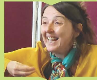
Pyn Stockman Longton Library